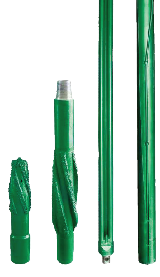
KOT-146 OGN 1